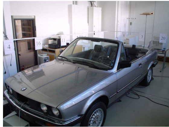
Figure 3. Driving simulator, surrounded by numbered sheets at eye level

during the simulation. Simulated traffic scenes are shown on a planar screen at a focal distance of 3 meters in front of the car driver. The HUD-based visualizations are shown by a second appropriately calibrated projector on the same screen 1 . The simulation covers a 50-degree visual field of view.