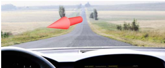
Figure 2. 3D arrow in front of the car pointing towards the position of imminent danger

The second visualization scheme presents a 3D arrow (figure 2). Its back end is placed about 3 meters in front of the driver in height of a typical driver's head. The front end points in the direction of the imminent danger.