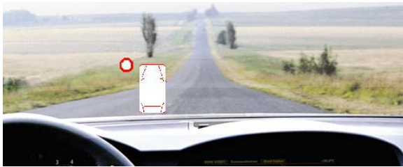
Figure 1. Bird's eye view showing the position of imminent danger relative to the car

The first scheme presents a two-dimensional bird's eye exocentric view of the car at a fixed position in front of the windshield (figure 1). The point of danger is indicated by an octagon. Several symbols were preevaluated. An octagon provides the best perception.